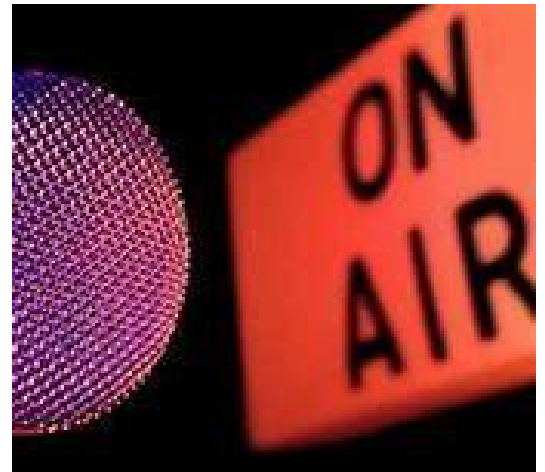
Radio is affordable 7 days per week